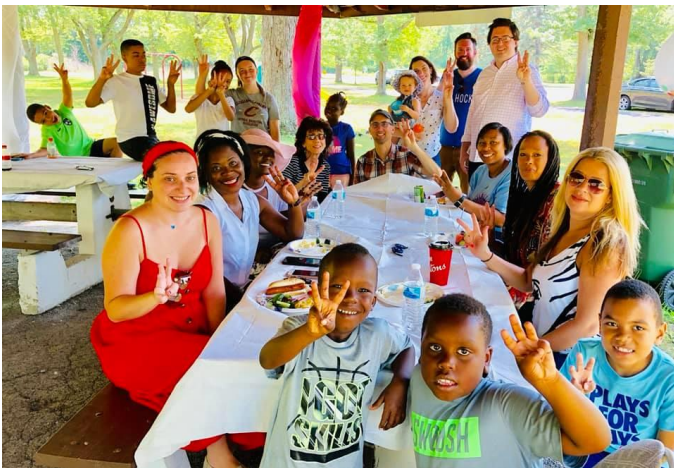
ICA Turned 3!