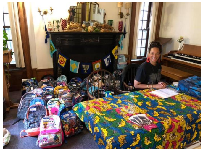
Back to School Event

The Griffin Newspaper Article: International Child Advancement