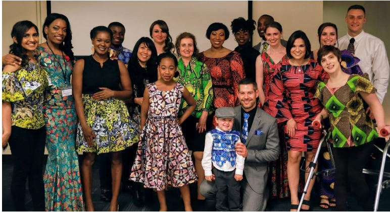
Empowered Fashion Show!

A look back at some of our 2019 highlights!