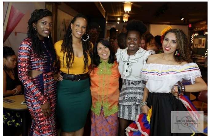
Fashion at the Daily Planet