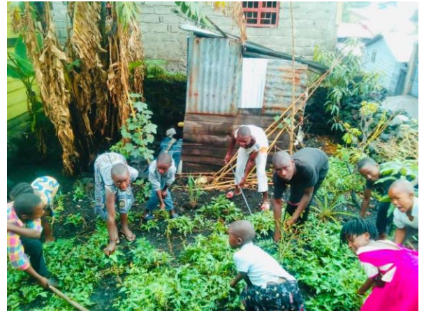
Land Purchase & Launch of Agricultural Vocational Training Program